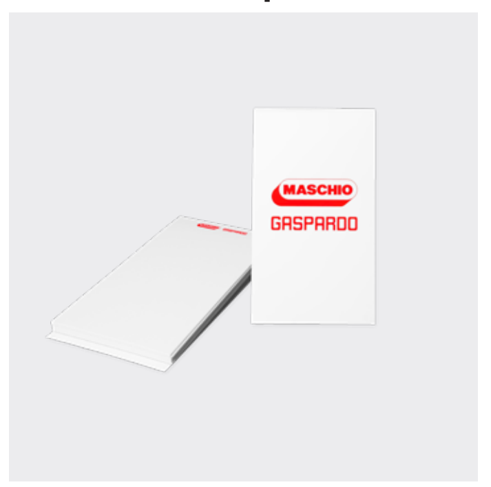
Pocket notepad with 50 tear-off sheets.