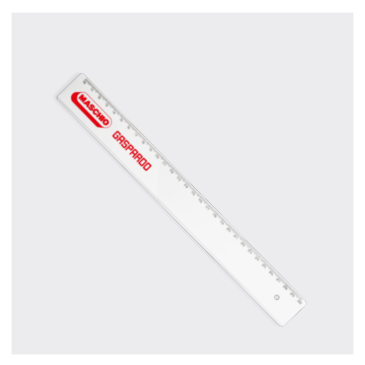
30 cm white plastic ruler.