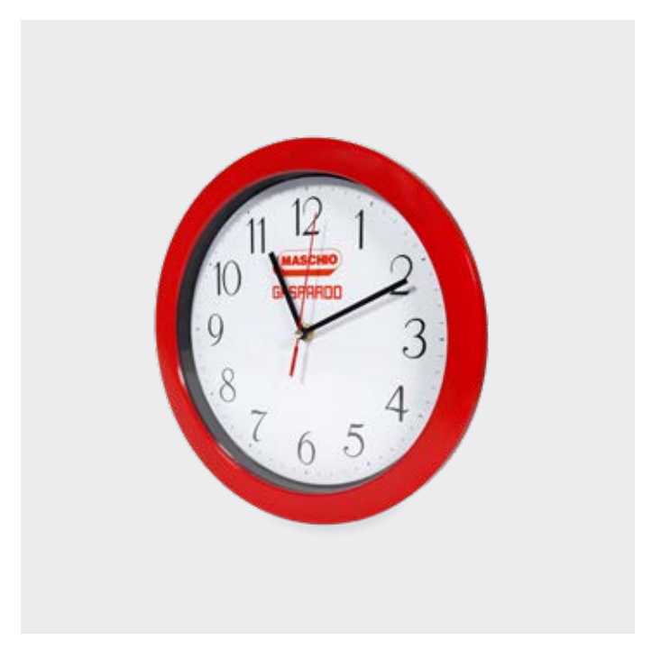
Wall clock with white background and red frame.