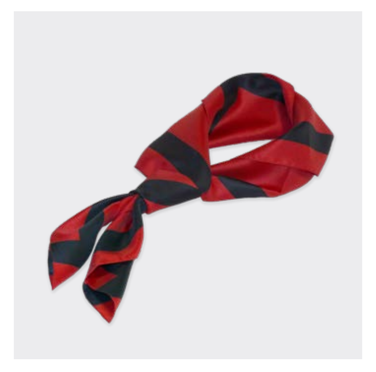
Foulard 80x80 cm.