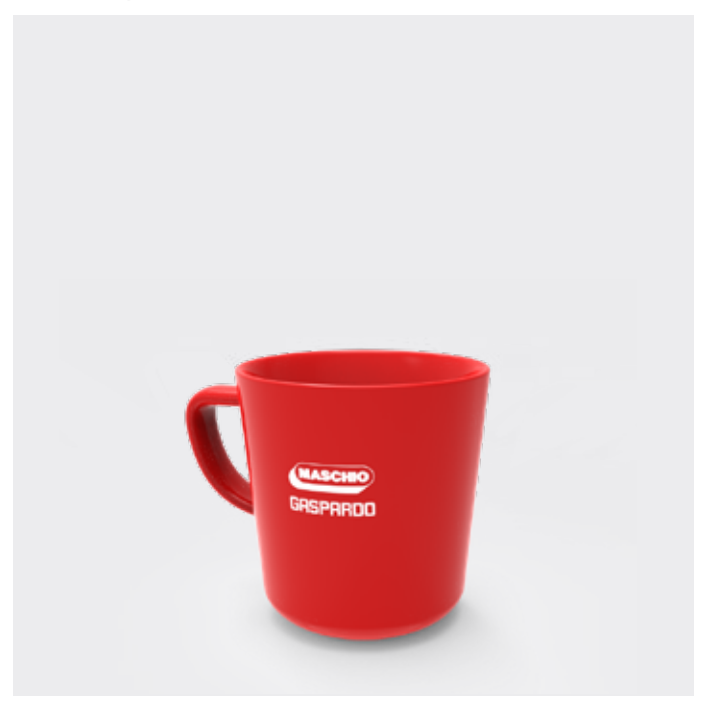
Ceramic mug, capacity 350 ml.