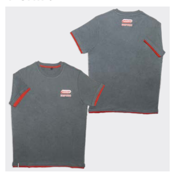
T-shirt with contrasting stripe on the sleeves and on the bottom edge.