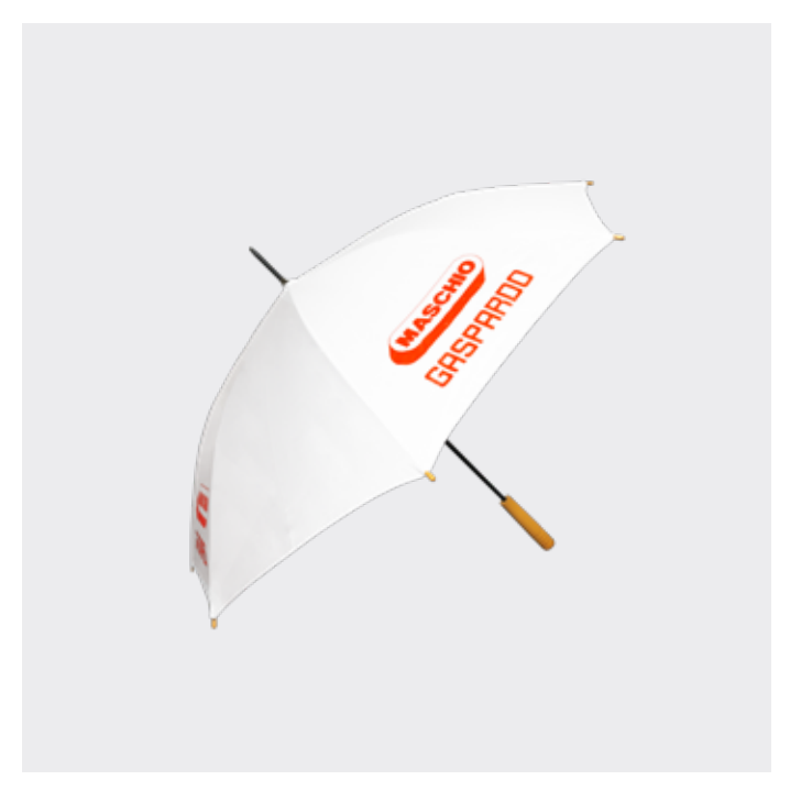
White umbrella with manual opening and large diameter.