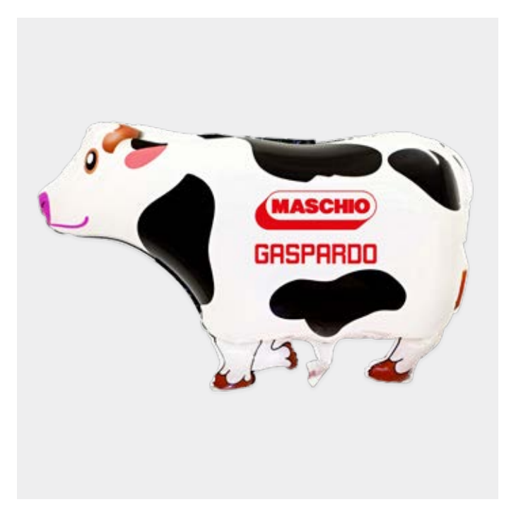
Printed cow-shaped balloon with red ribbon.