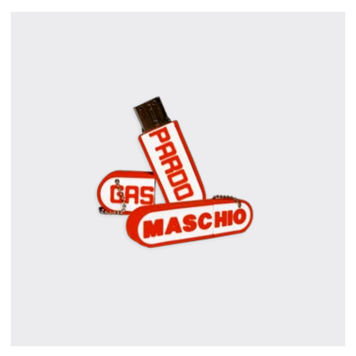
USB flash drive with double front and back logo and 32 GB of storage capacity.