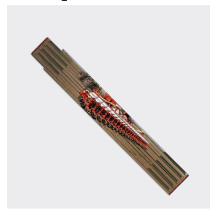
Folding ruler made of white plastic, 2 metre lenght composed of 10 segments.