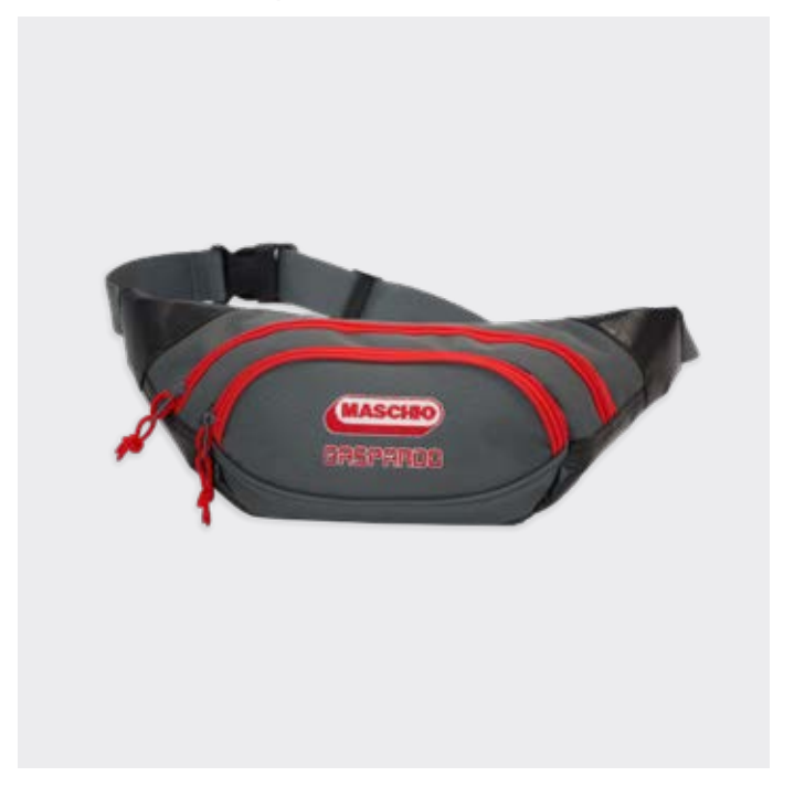
Belt bag with two compartments and an inside zipper pocket, adjustable belt.