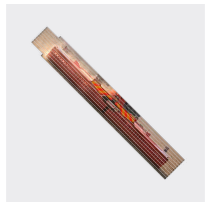
Folding ruler made of white plastic, 2 meter length composed of 10 segments.