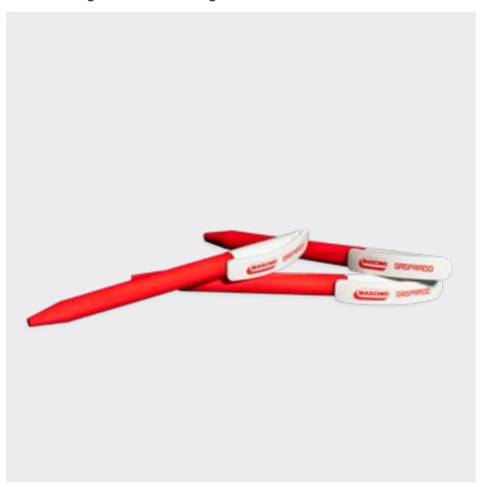
Practical and reliable pen with high quality black ink.