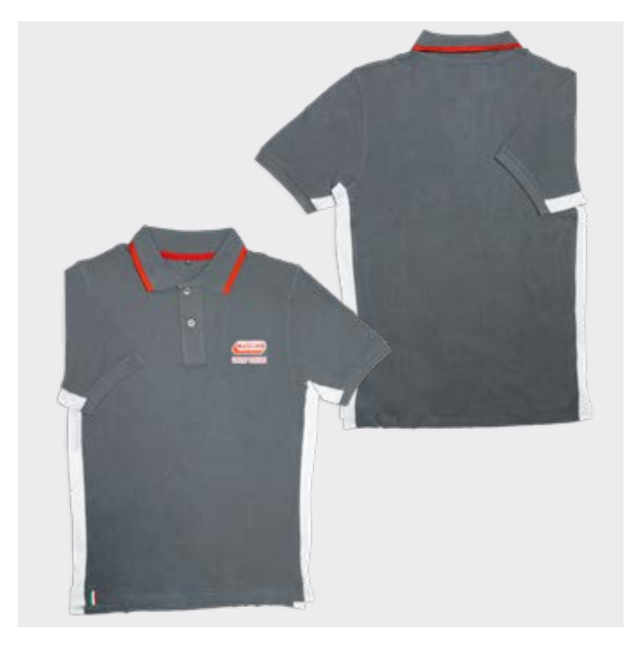
Polo with contrasting stripe on the collar and white side bands.