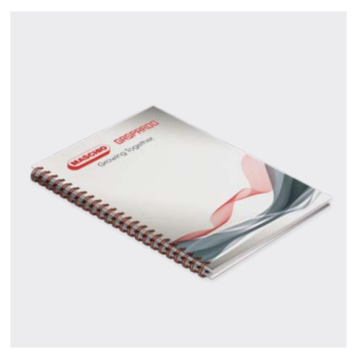
A4 hardcover exercise book, double side wire binding and white papers.