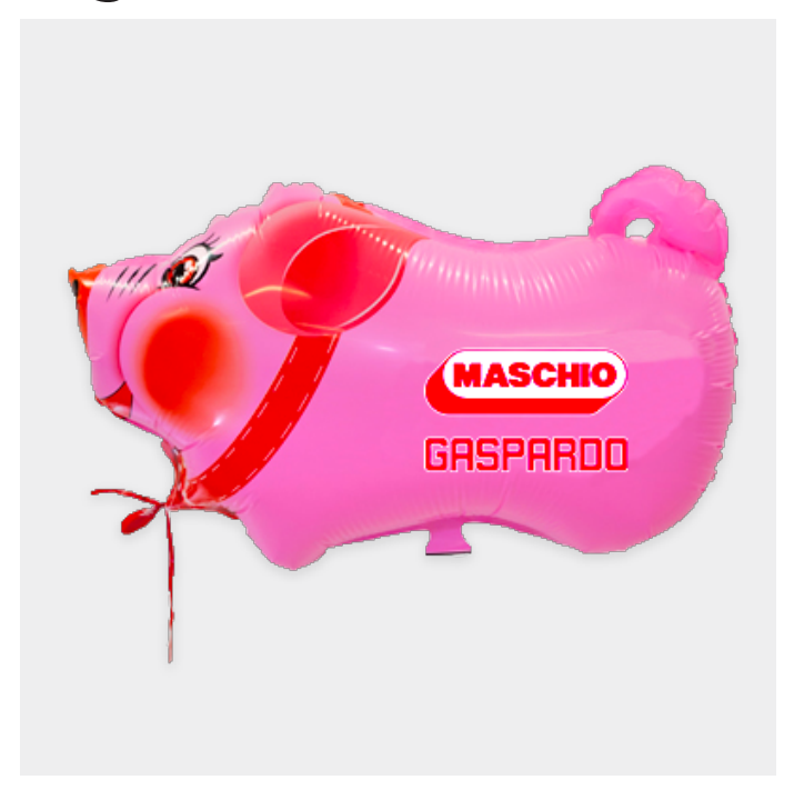
Printed pig-shaped balloon with red ribbon.