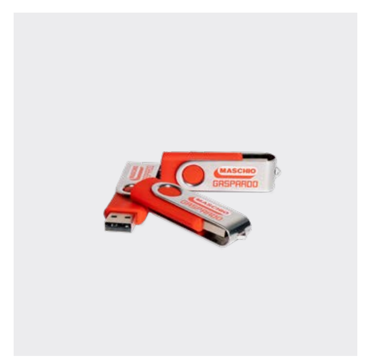
USB 3.0 drive with 8 GB storage capacity.