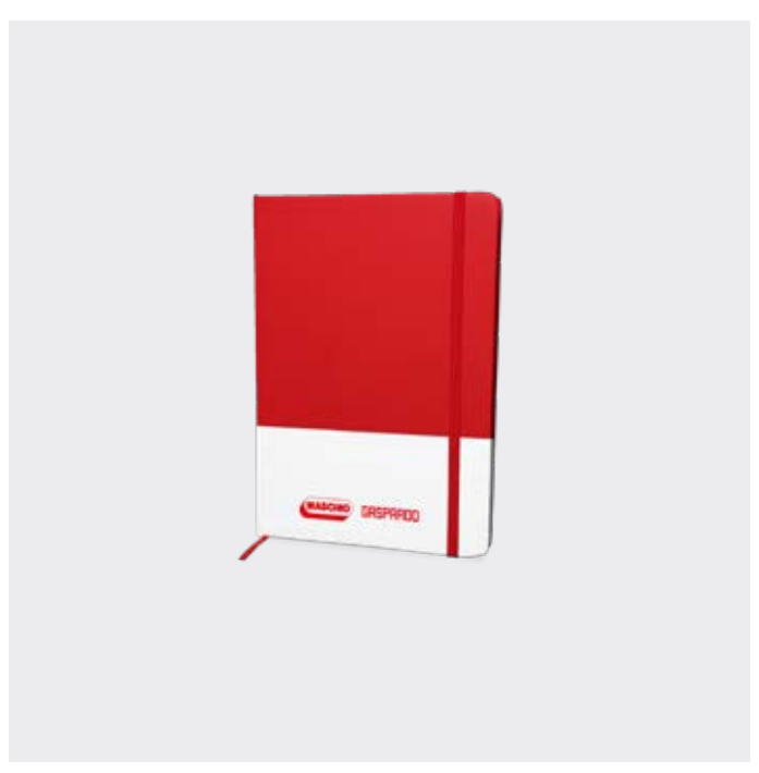
A5 notebook with non-plasticised hardcover and lined papers. Equipped with elastic closure.