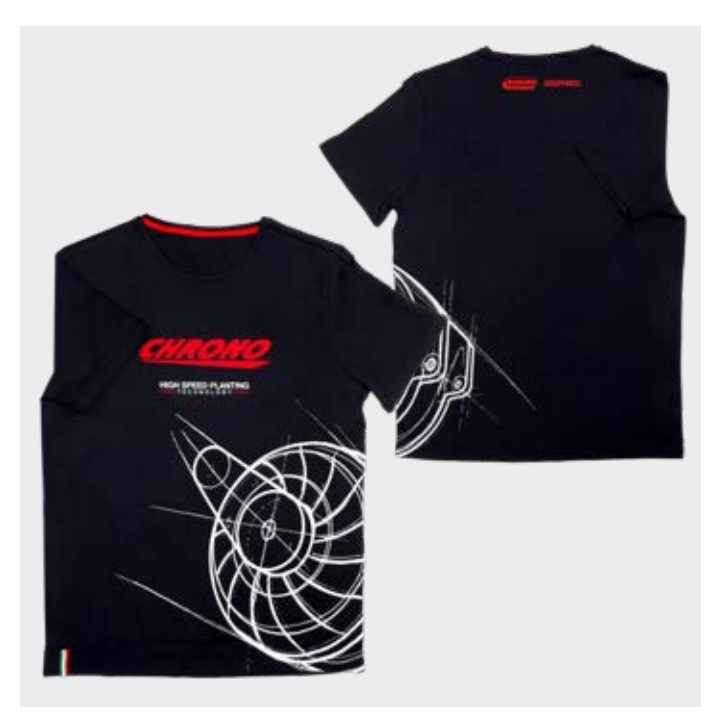
Representative T-shirt of CHRONO technology.