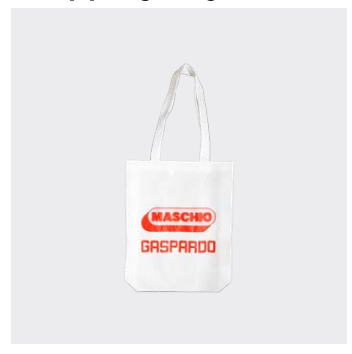
TNT shopping bag 36x40 cm with bellows 8 cm and long handles.