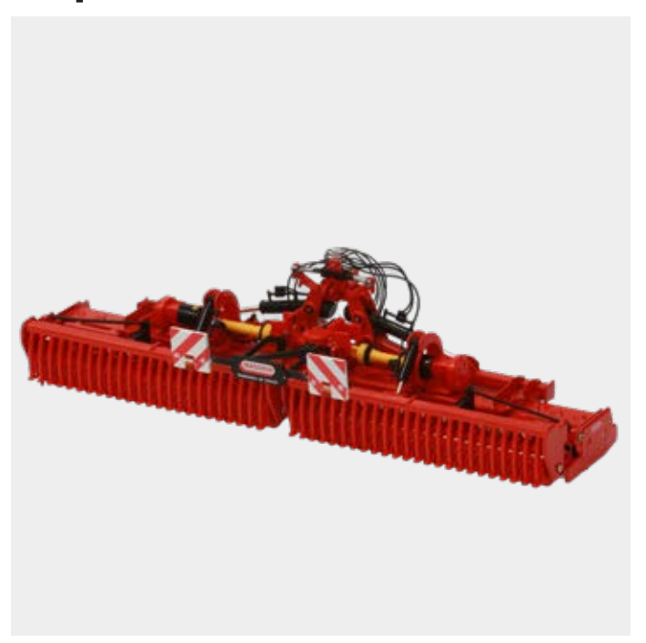
Aquila 6000 model for collectors. Built in scale 1:32.