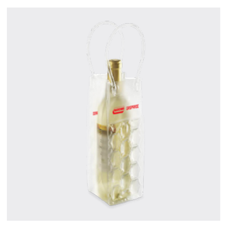
PVC Thermal bag with reinforced handles and coolant inside.